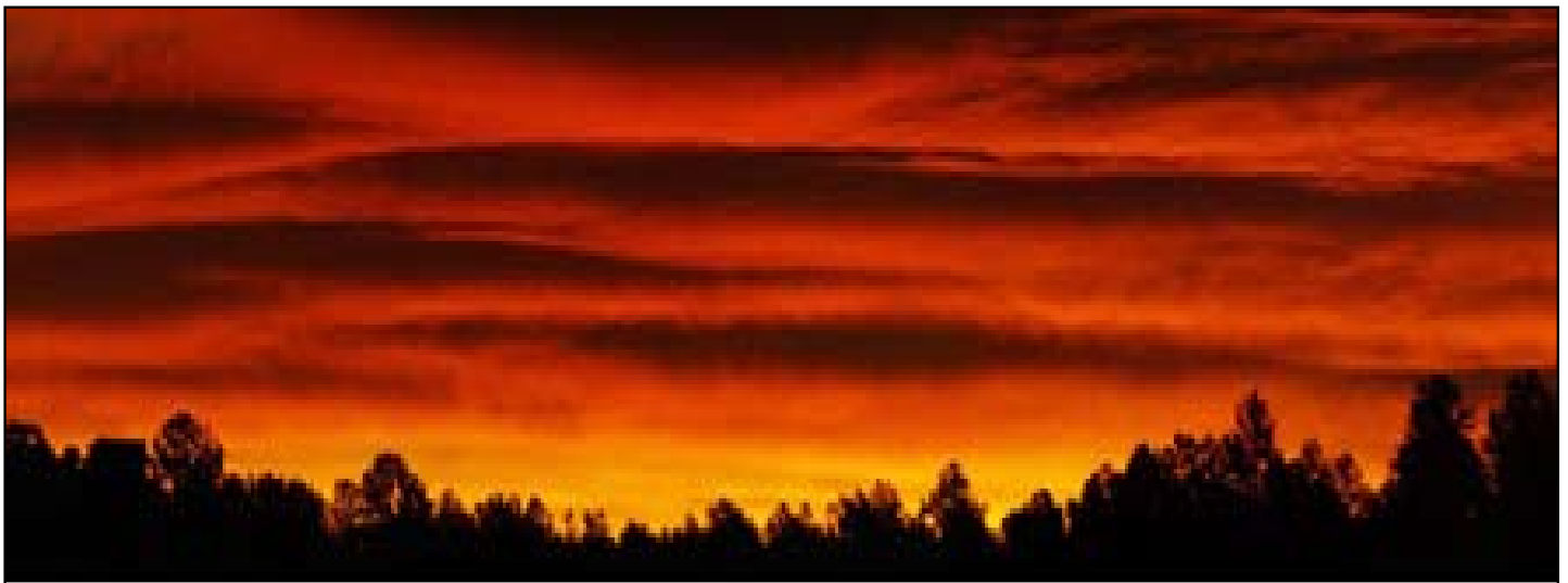
"Wet Mountain Sunrise" photo by Gary Benson of Westcliffe.