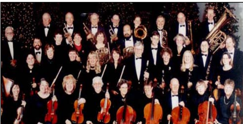
"The Alpine Orchestra performs May 23 in Salida"

The Studio Tour was created to give the public a chance to meet the variety of talented artists in our community, observe their creative processes, view their work...and to give local artists a powerful opportunity to show and sell their creations directly to patrons. Salida artists on last