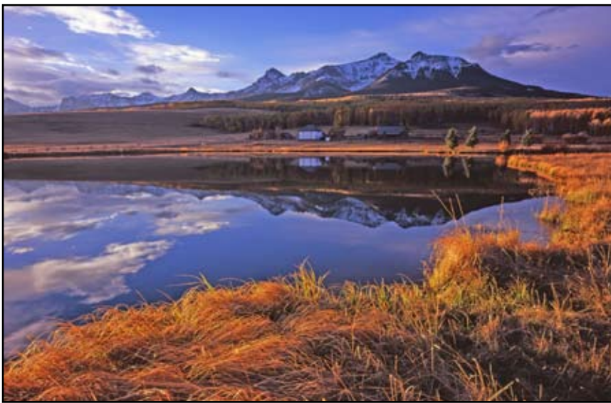
An exhibit of photos from John Fielder’s book “Ranches Of Colorado”—like this stunning shot of Last Dollar Ranch near Ridgway—is now on display at Fremont Center for the Arts.

DIA SHOW: The Colorado Art Ranch exhibit at Denver International Airport, titled “33 Ideas” and originally scheduled to end June 15, has been extended until