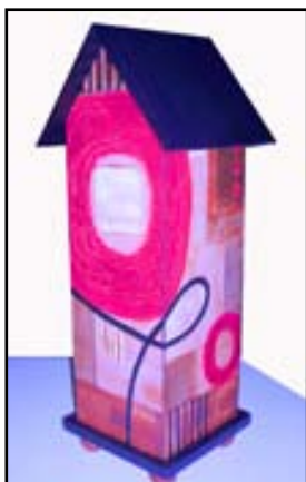
"House of Possibilities" by Dee Sapper